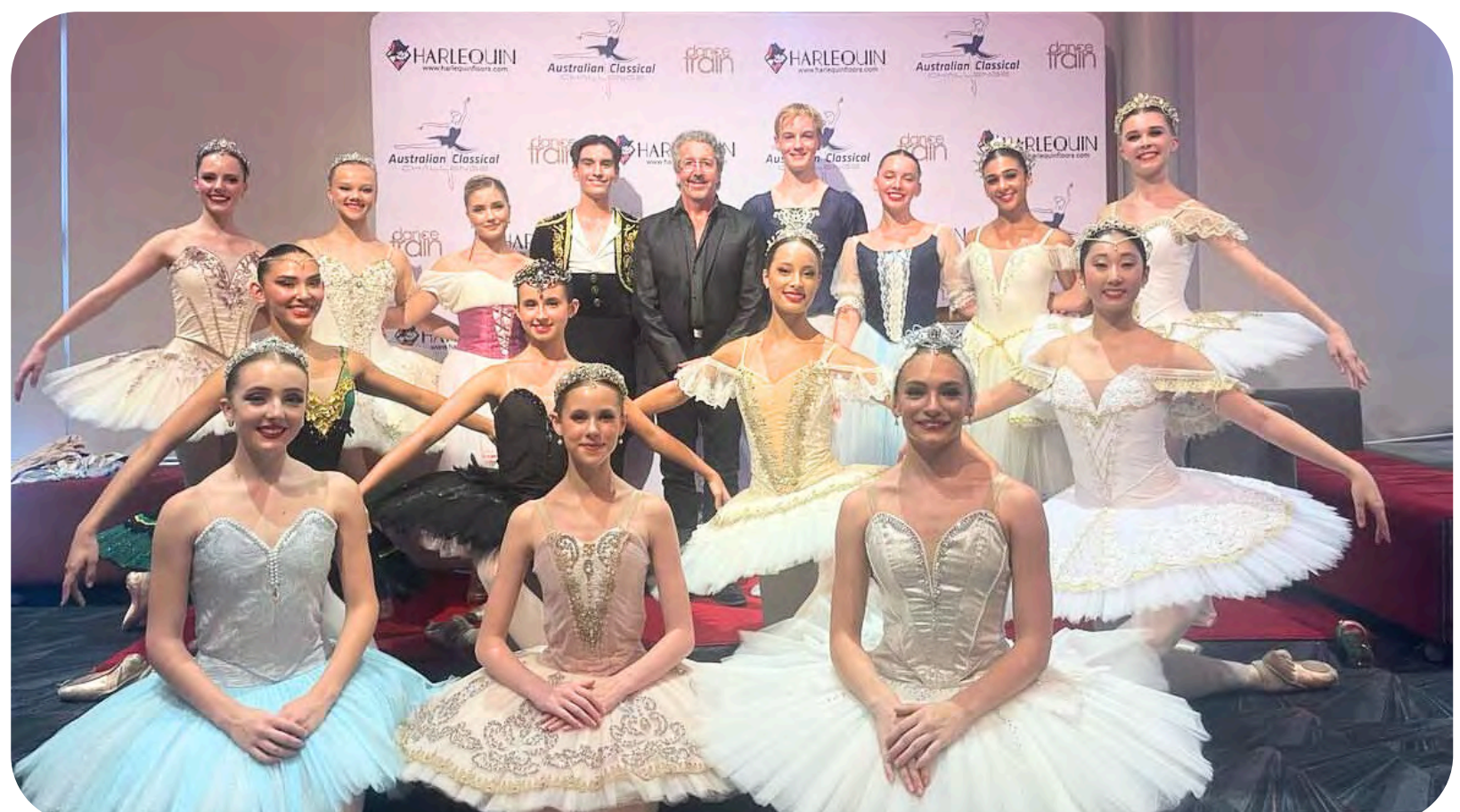
2024 SENIOR CLASSICAL FINALISTS

THIS SCHEDULE IS A GUIDE ONLY AND IS SUBJECT TO CHANGE