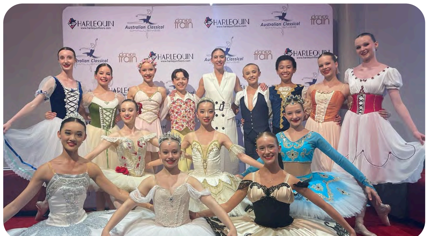
2024 INTERMEDIATE CLASSICAL FINALISTS

THIS SCHEDULE IS A GUIDE ONLY AND IS SUBJECT TO CHANGE