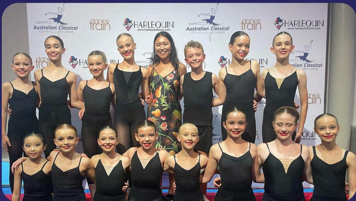
2024 JUNIOR CONTEMPORARY FINALISTS