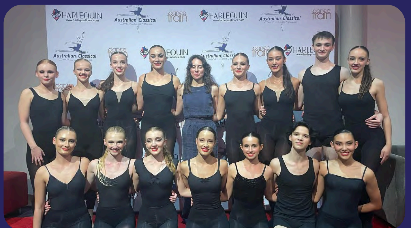
2024 SENIOR CONTEMPORARY FINALISTS