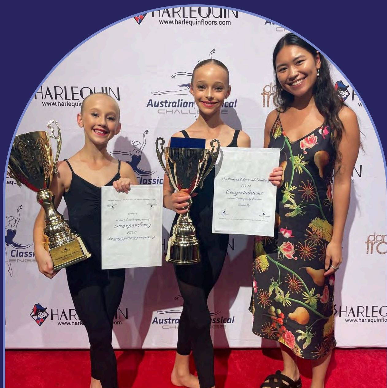
JUNIOR CONTEMPORARY DIVISION WINNERS 2024