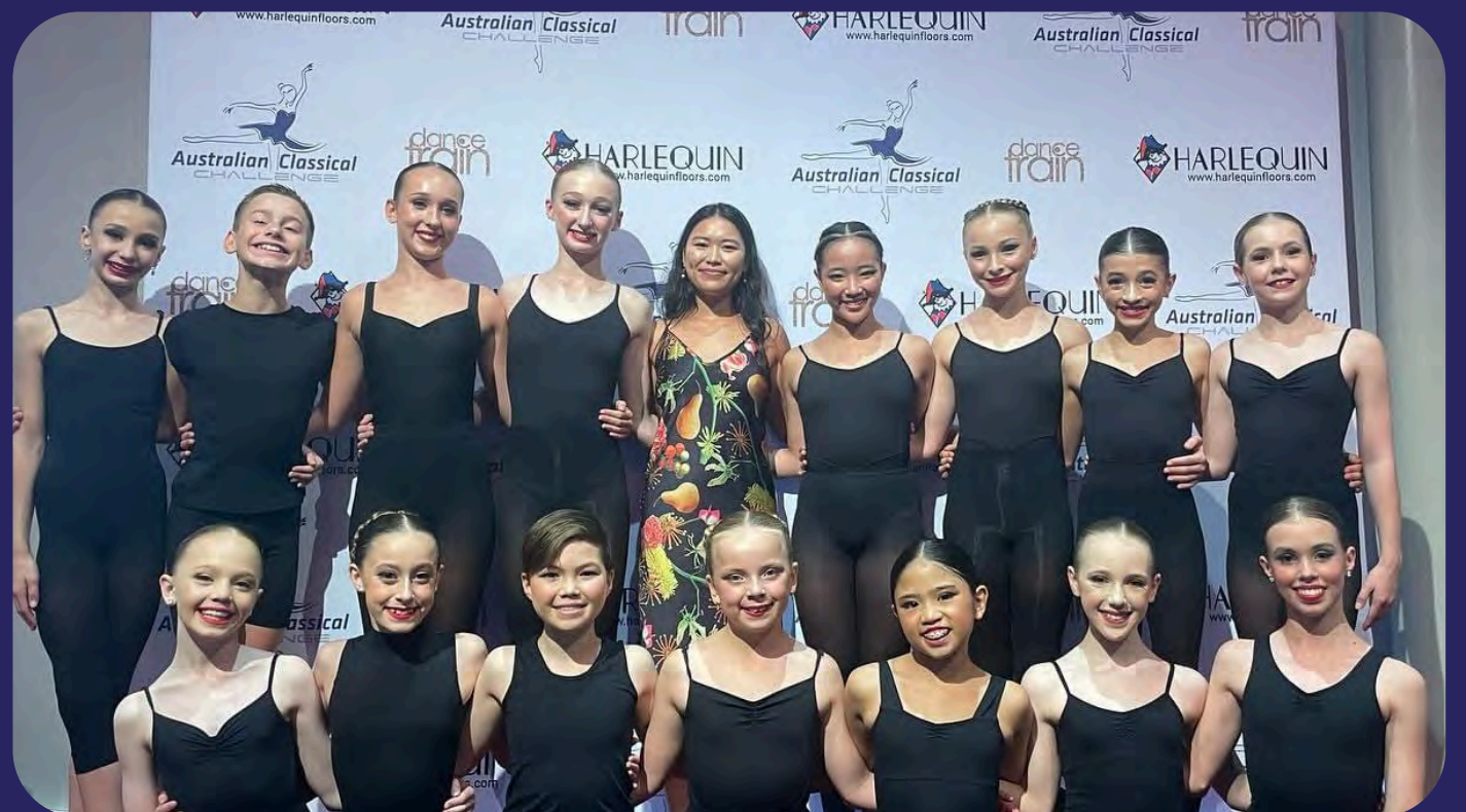
2024 PRE-INTERMEDIATE CONTEMPORARY FINALISTS