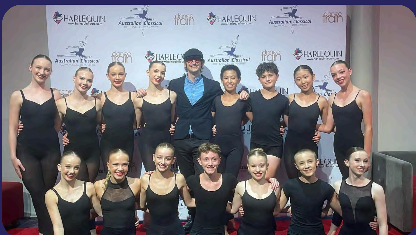
2024 INTERMEDIATE CONTEMPORARY FINALISTS