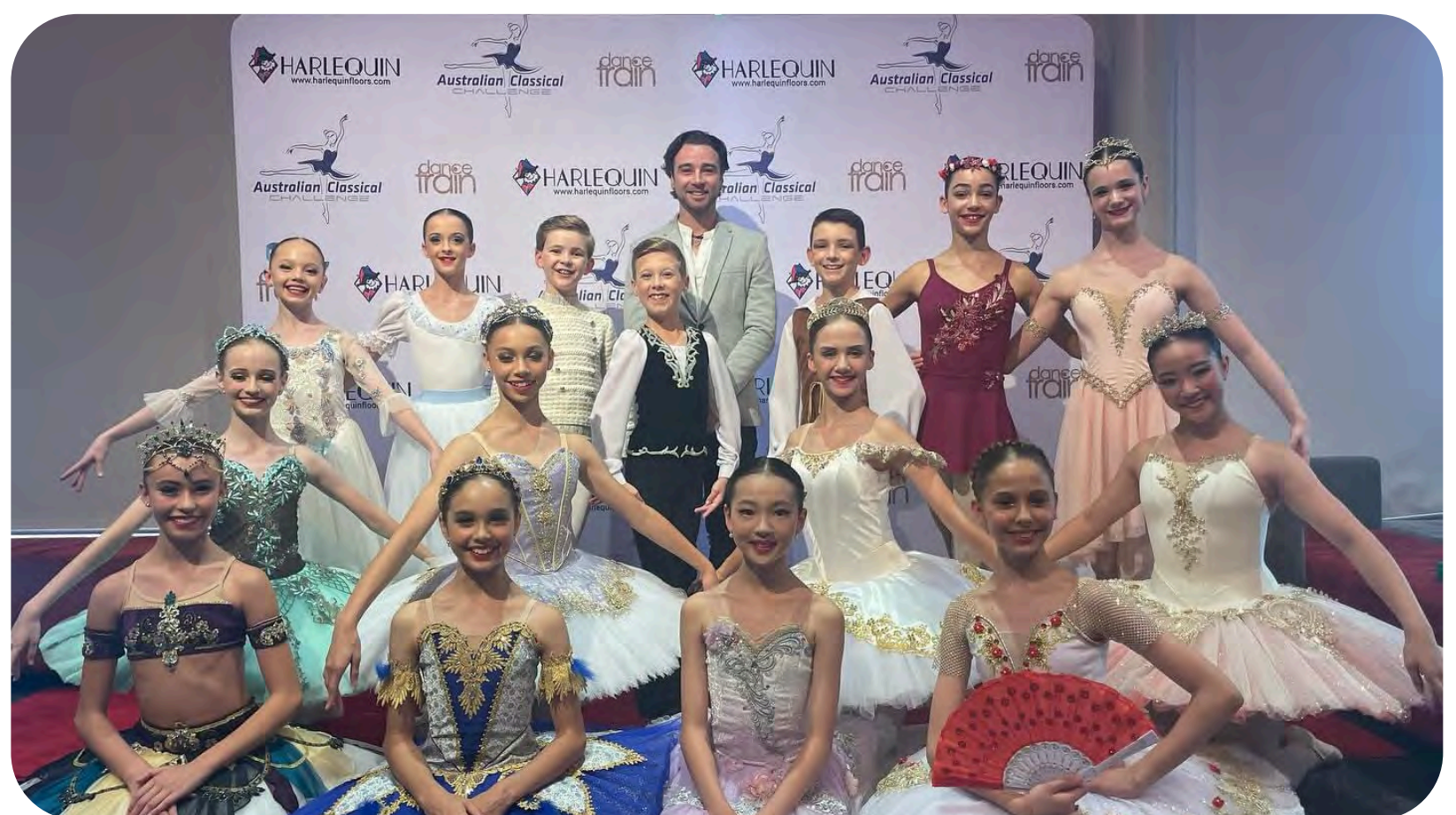
2024 PRE-INTERMEDIATE CLASSICAL FINALISTS