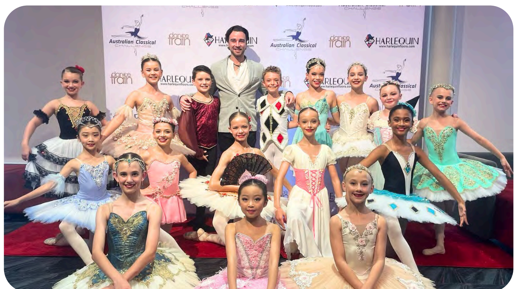
2024 JUNIOR CLASSICAL FINALISTS