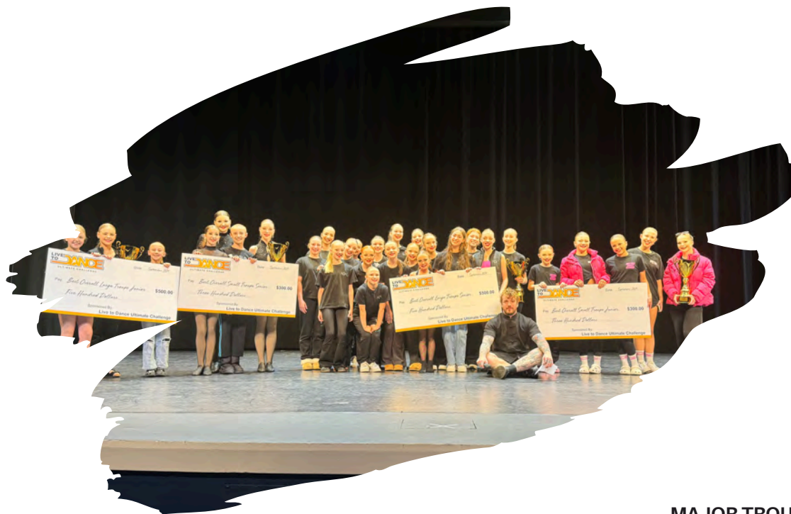
MAJOR TROUPE AWARDS