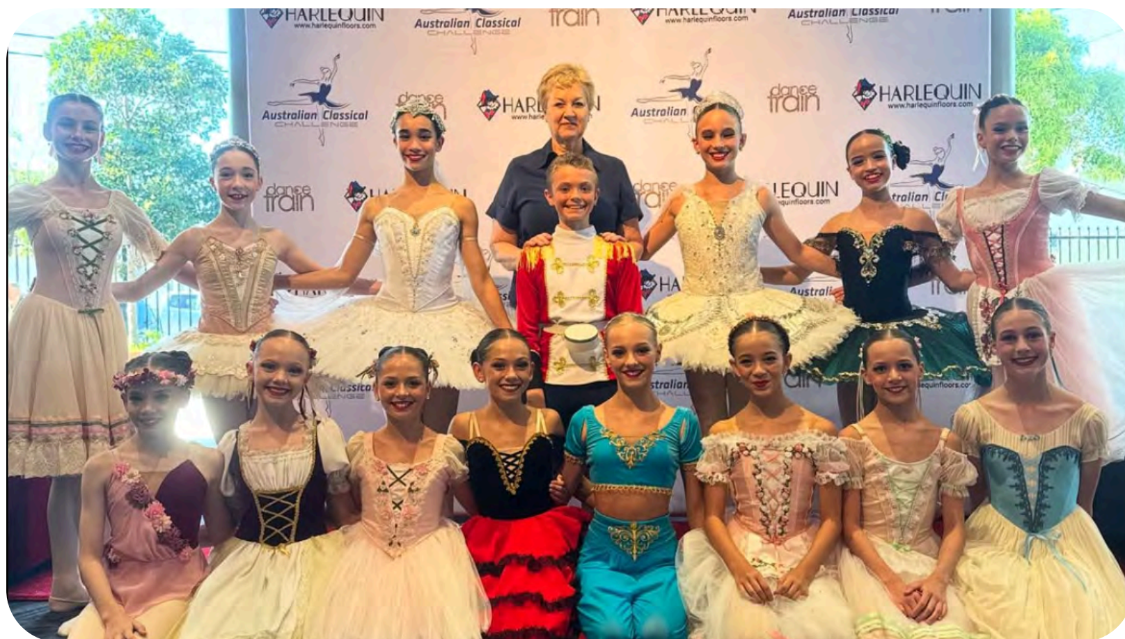
2025 PRE-INTERMEDIATE CLASSICAL FINALISTS