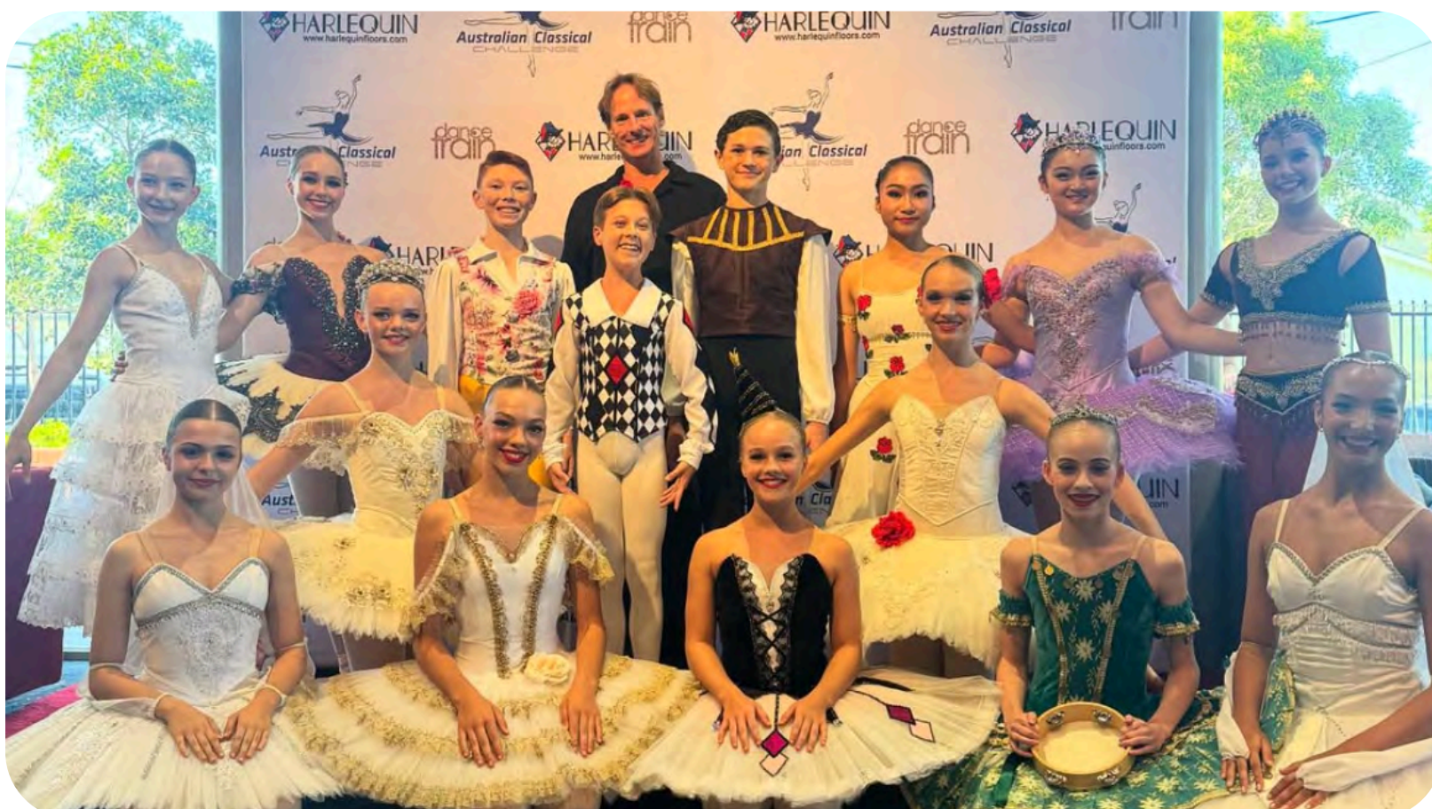
2025 INTERMEDIATE CLASSICAL FINALISTS

THIS SCHEDULE IS A GUIDE ONLY AND IS SUBJECT TO CHANGE