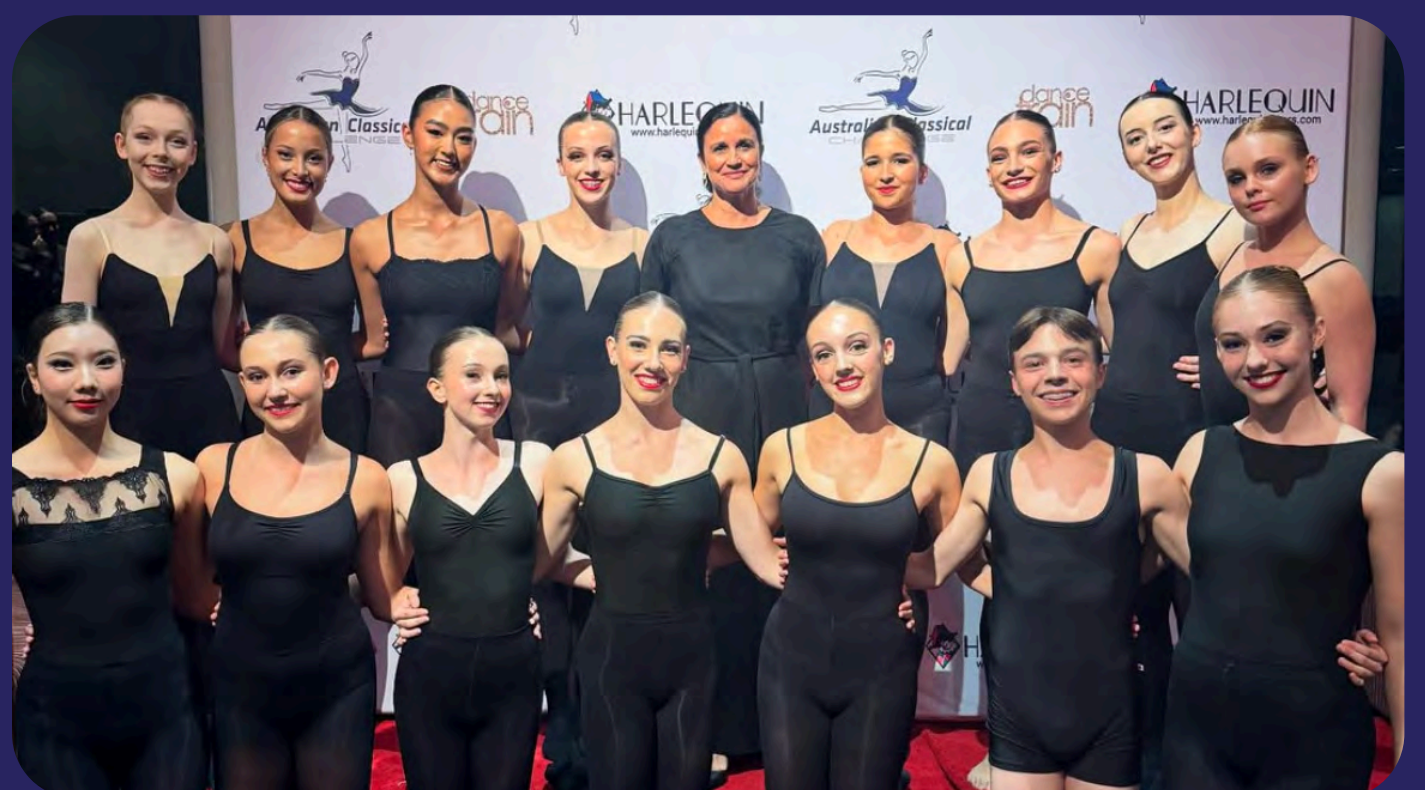
2025 SENIOR CONTEMPORARY FINALISTS