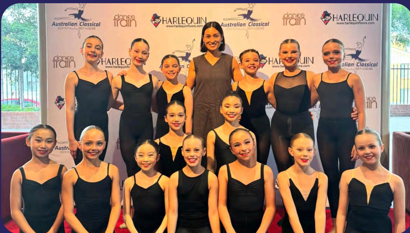
2025 JUNIOR CONTEMPORARY FINALISTS