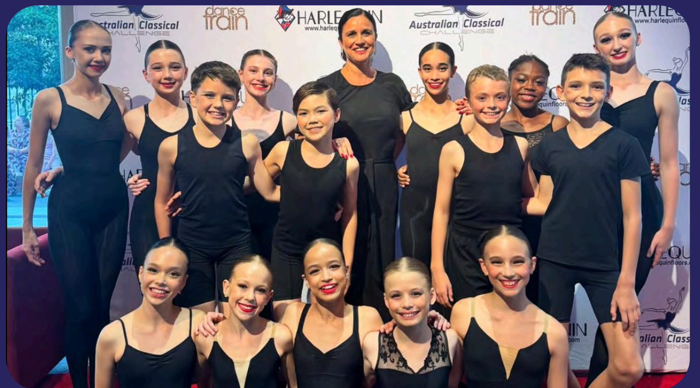
2025 PRE-INTERMEDIATE CONTEMPORARY FINALISTS