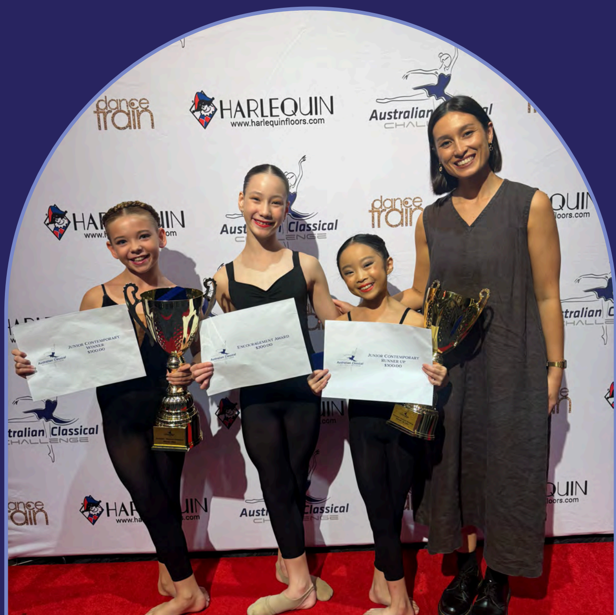
JUNIOR CONTEMPORARY DIVISION WINNERS 2025