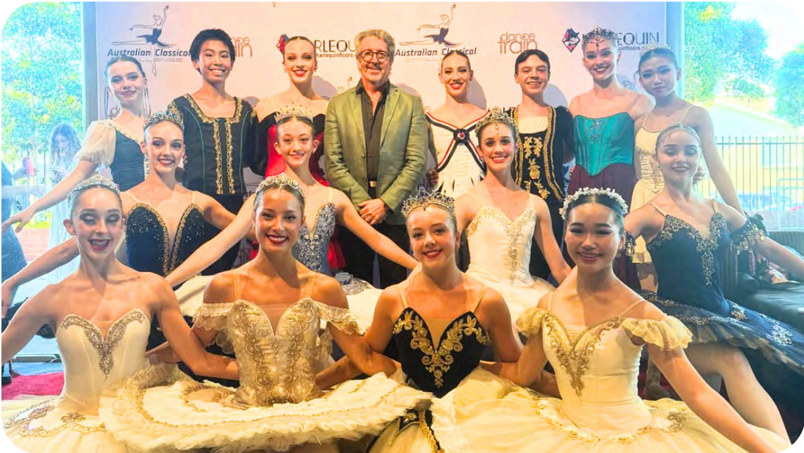
2025 SENIOR CLASSICAL FINALISTS

1PM SENIOR DEFILÉ REHEARSAL 3PM FINALS COMMENCE