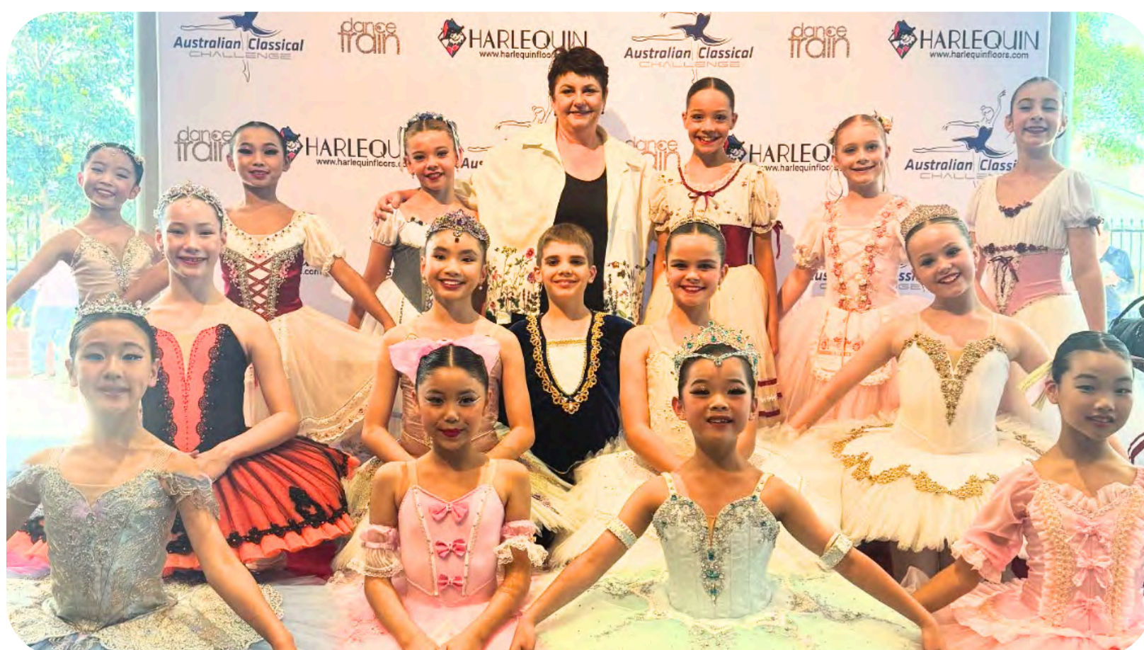
2025 JUNIOR CLASSICAL FINALISTS