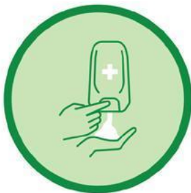
USE HAND SANITIZER