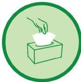
STAY HOME IF YOU ARE SICK